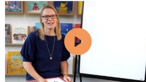
How we teach blending