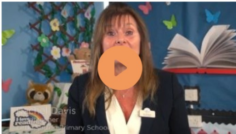
A quick guide to alien words