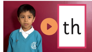
Phase 2 sounds taught in Reception Autumn 2