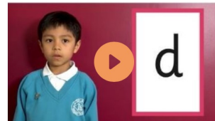
Phase 2 sounds taught in Reception Autumn 1