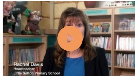
How we teach tricky words