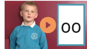
Phase 3 sounds taught in Reception Spring 1