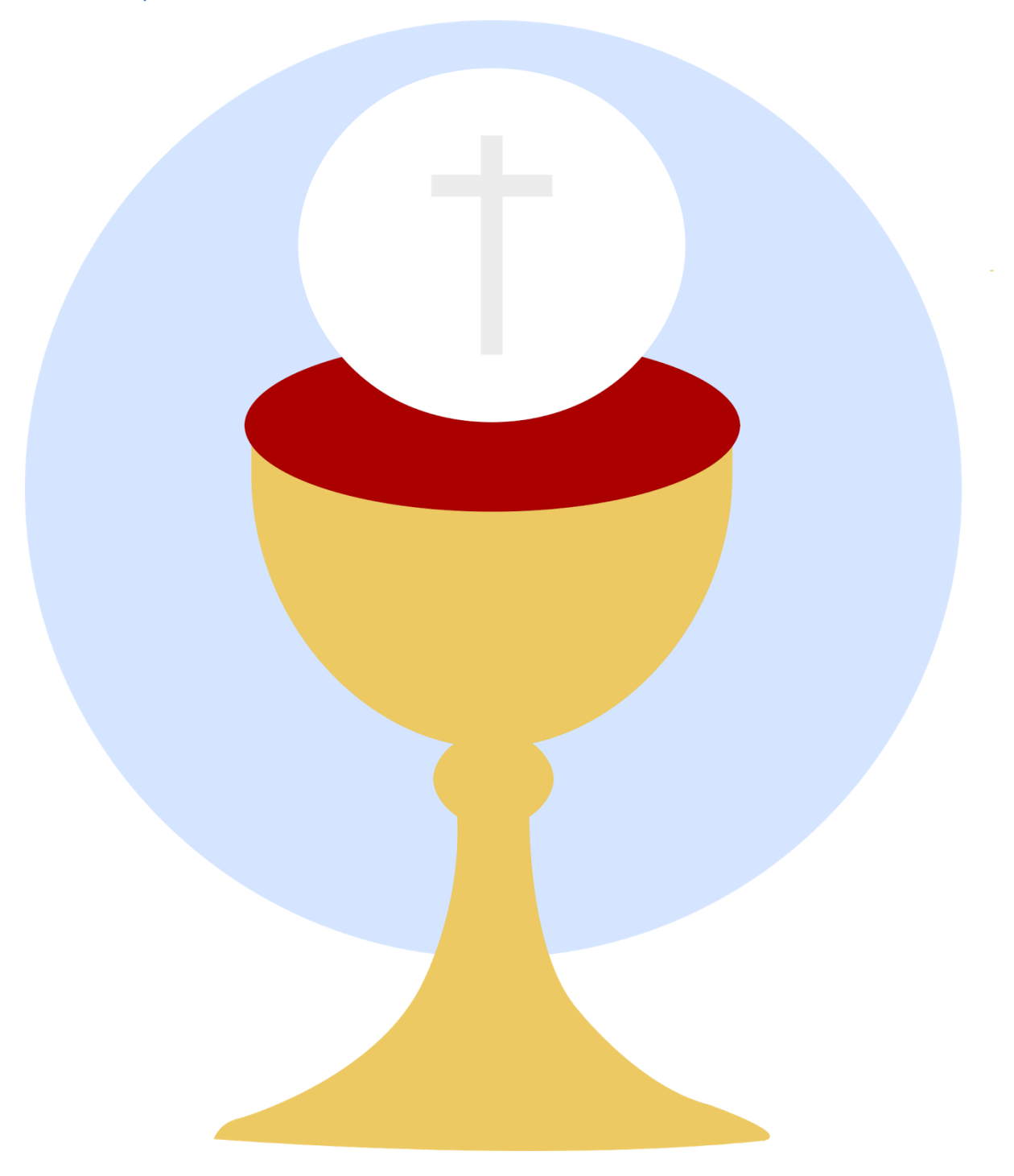
First Holy Communion